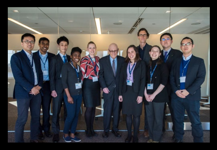
Current R/HSR graduate students and local R/HSR alumni joined in the celebration of the 25th anniversary of the JR East-MIT partnership.

In addition to market selection, the R/HSR group also looks at areas of safety, ontime performance, economic development